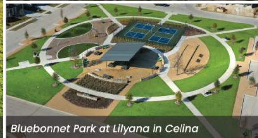
Bluebonnet Park at Lilyana in Celina

bluewood™ Lilyana™ Union Park™ harvest™ PECAN SQUARE..