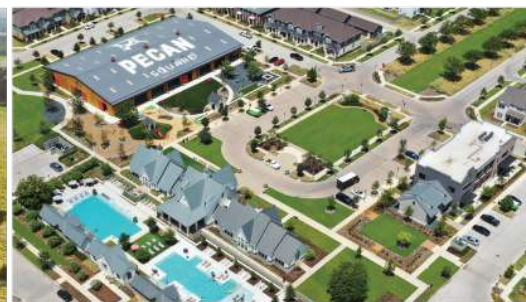
Town Square at Pecan Square in Northlake